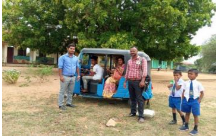
The total cost of the project is $1000

Addressing transportation challenges at Akkuranai Bharathi Vidyalayam, we have implemented proactive measures by providing three-wheeler services. This thoughtful solution not only facilitates a smoother commute for teachers but also creates a positive ripple effect on the students. Eliminating transportation barriers is vital to ensuring the safe and consistent arrival of teachers, particularly female educators, at the school.